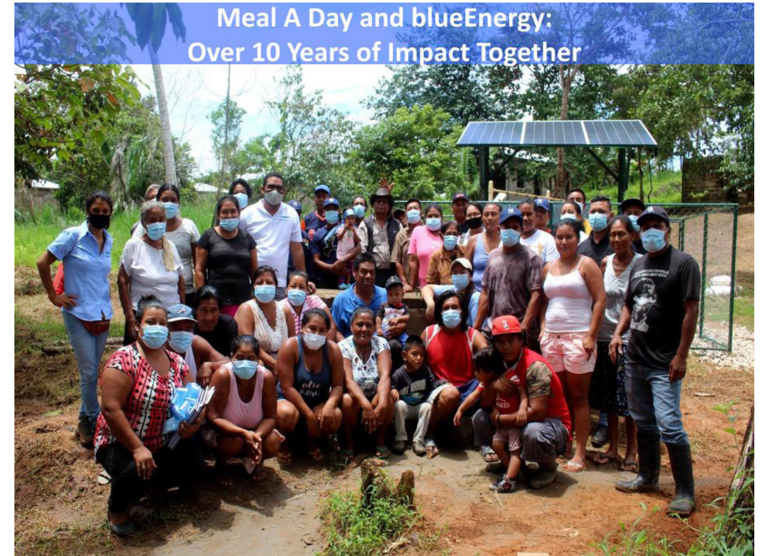
Meal-a-Day partners with Blue Energy on many projects including providing safe drink water to many communities.