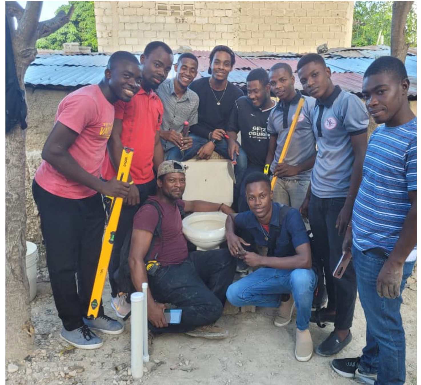
Meal a Day launched this vocational school 6 months ago. 125 plus students learning trades.