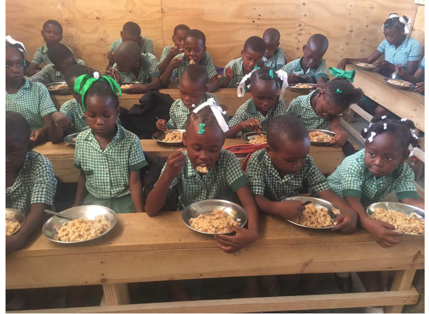
Meal-a-Day serves a Meal a day to over 500 children at the three schools it supports.