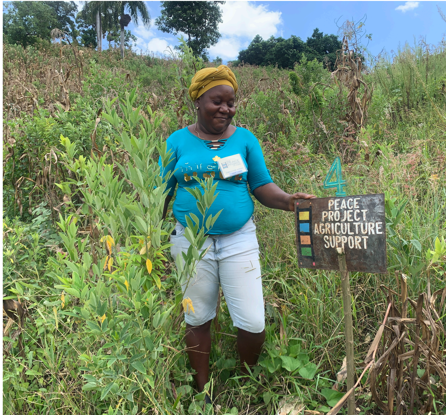
Meal a Day is supporting an Agricultural Support project first begun and now administered by PEACE Project of Haiti. 70 farmers in the rural Carrefour area are getting advice and instruction as well as good seed and fertilizer from a certified agronomist. The idea is to help them produce more and better food for their tables and to sell at the market.