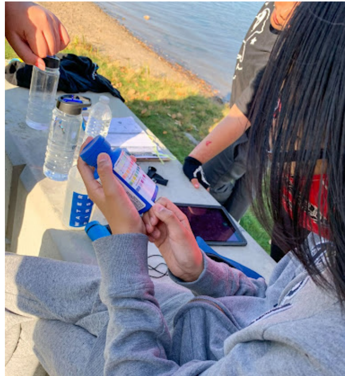
Indigenous students learn about hydrology and watershed ecology while further developing their relationship with water and their lands in Northern Ontario.