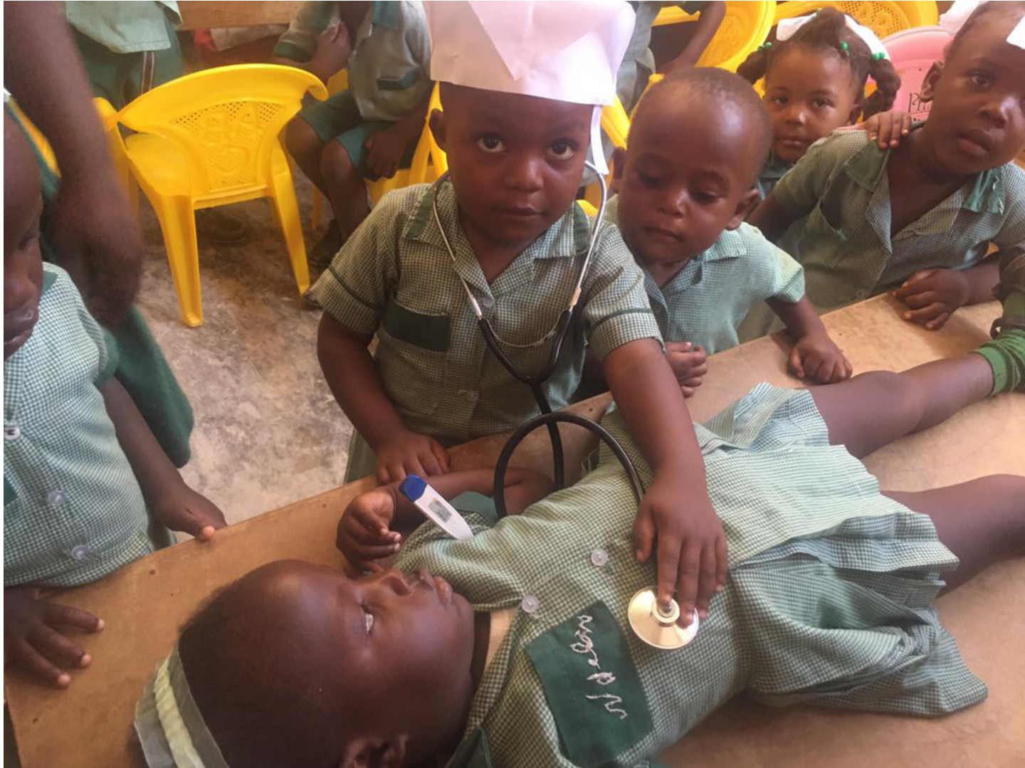
Kindergarten starts at age 4 with three levels (ages 4, 5, and 6).