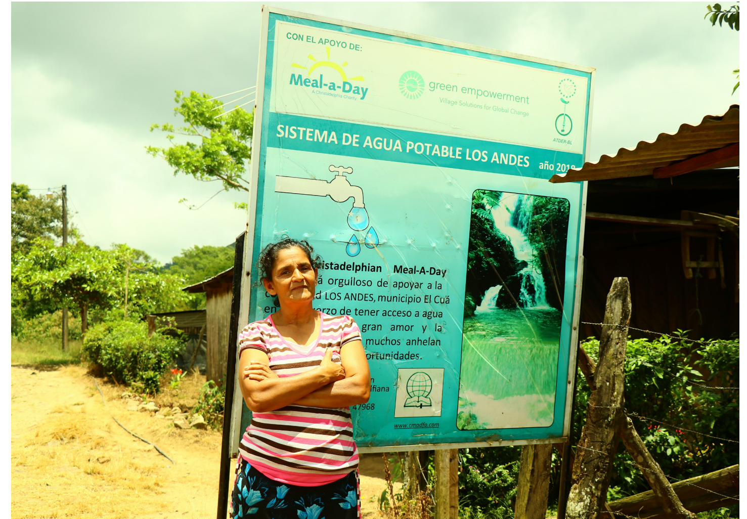
Meal-a-Day partners with Green Empowerment on many projects including ensuring potable water and WASH (Water, Sanitation and Hygiene) training.