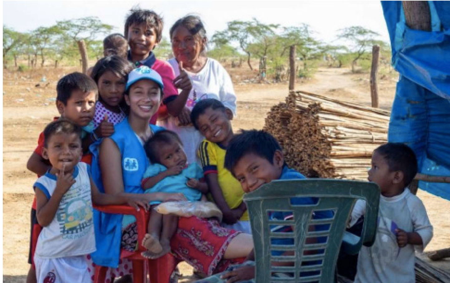
An SOS staff visiting a family whose children participate in the Child-Friendly Space.

Whatever you did for one of the least of these brothers and sisters of mine, you did for me.